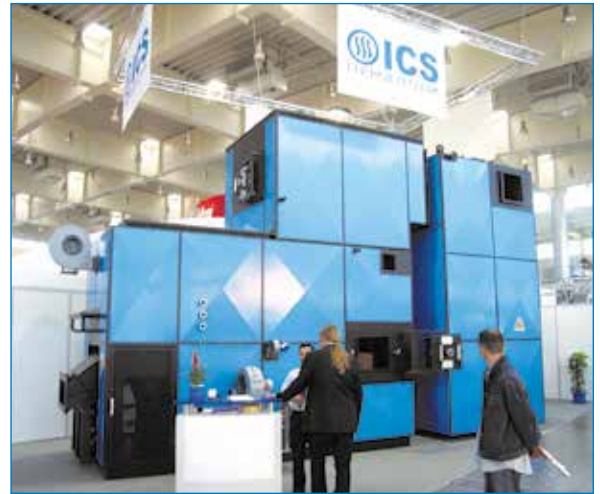
Biomass hot air generator ICS HotAir

The ICS HotAir technology developed by us for the drying industry allows the production of warm and hot air for a wide range of applications based on renewable energy sources and residual products from agriculture and forestry. The fuels are transported by heavy transport systems to highly efficient and very flexible grate firing plants. The flue gases from the combustion process are led controlled into a hot air generator (flue gas / air heat exchanger) in which the energy is transferred to the incoming fresh air. The spatial separation of the flue gases and the fresh air in the heat exchanger allows an indirect heating process in order to produce pollution-free warm or hot air. A highly stable and efficient operation of the ICS HotAir systems is guaranteed by a series of continuous measuring devices and a reliable combustion control.