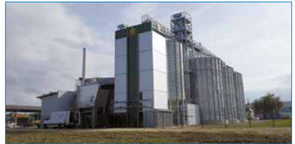
Drying plant for maize and grain